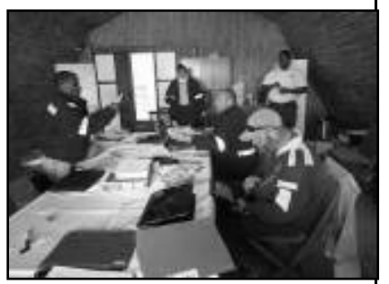
IC team is expecting from them.