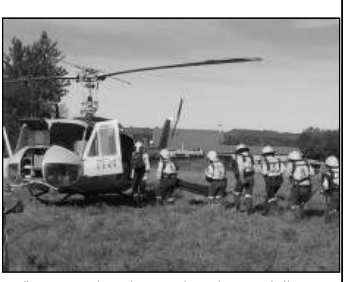
"Team members busy with a Chopper drill run