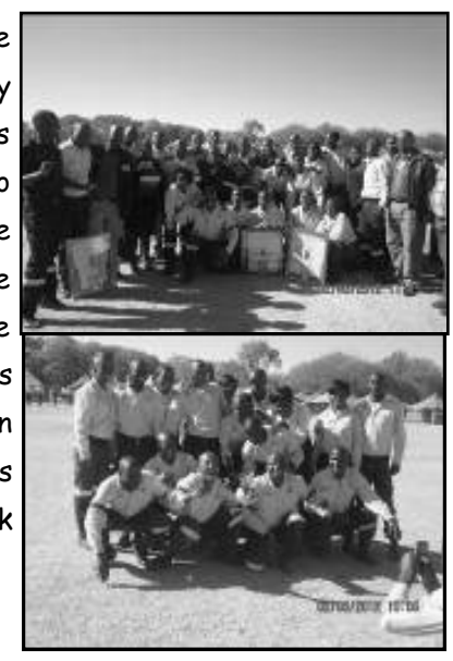
This is the winning team together with their stakeholders and base managers

The heroes of Gauteng and North West made an excellent job. From the 27th of May until 2<sup>nd</sup> of June 2012, the Gauteng & North West held a Safety & Survival Training Camp at Vryburg Show Ground. 500 fire fighters attended the camp. It was a good opportunity for fire fighters to get to know each other and learn what other teams are doing. The purpose of the camp was to check if our fire fighters are physically and mentally fit. There were activities that took place namely Social Development activities. The purpose of the social development activities was to show the fire fighters that they can't only fight fire but there are many things that they can do in life and also to keep them motivated. Stakeholders from Vryburg gave us support. Dr Ruth Mompati, District Municipality was with us the whole week at the camp and they also gave us lot of support