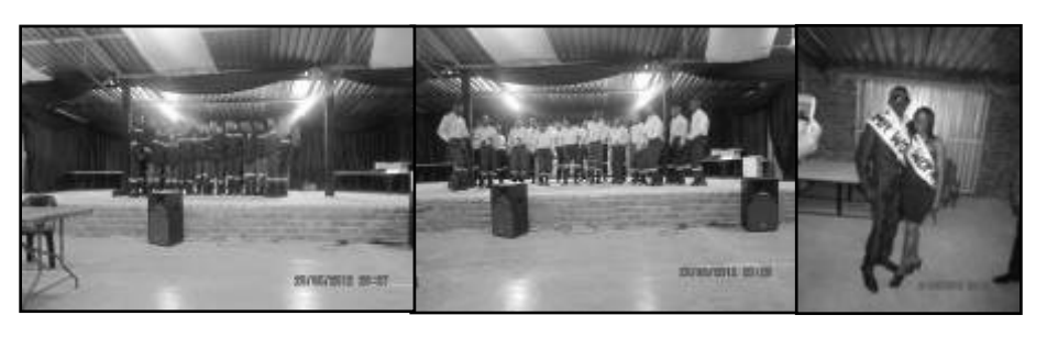
Choir competition and Mr and Ms WOF 2012 Gauteng and North West